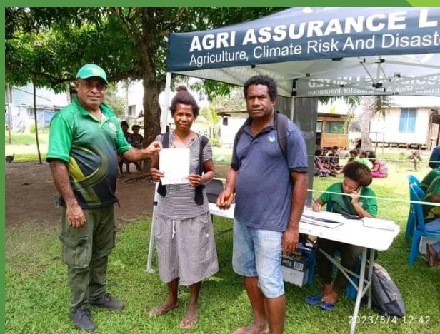
A woman farmer received her certificate of currency after Insuring her cocoa farm.