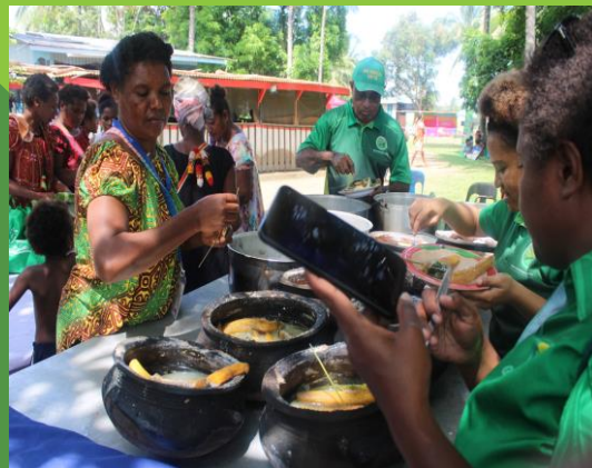
Traditional dish of Markham cooked in clay pots.