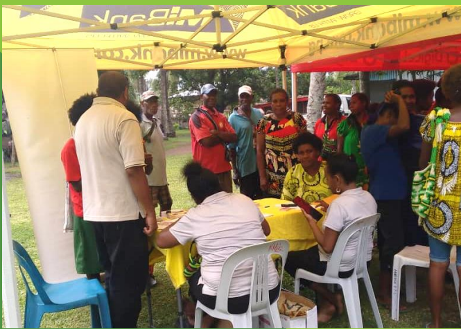
Women farmers line up to open their Hibiscus Bank Accounts with MiBank.