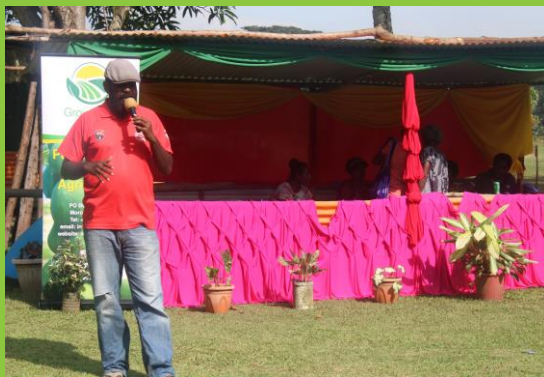
Digicel Cell Moni team representative giving his remarks on the Cell Moni Wallet product.