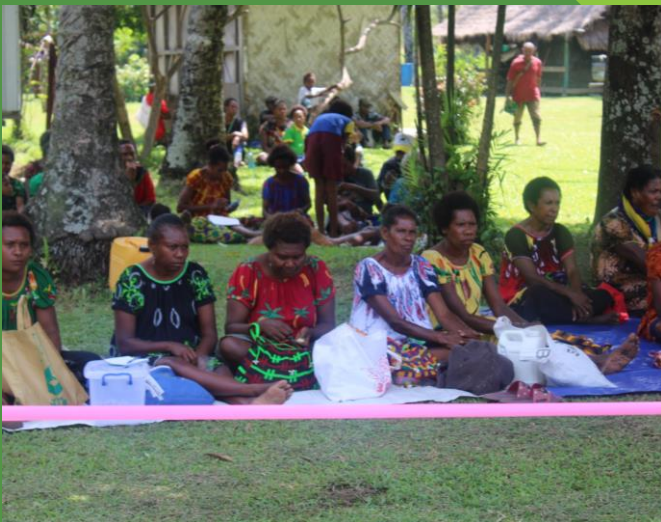
Women Farmers of Ziampir Horticulture Group.