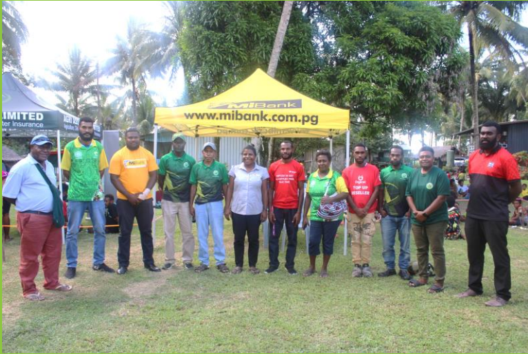
Grow PNG and partners MiBank, Agri Assurance, and Digicel PNG Cell Moni.