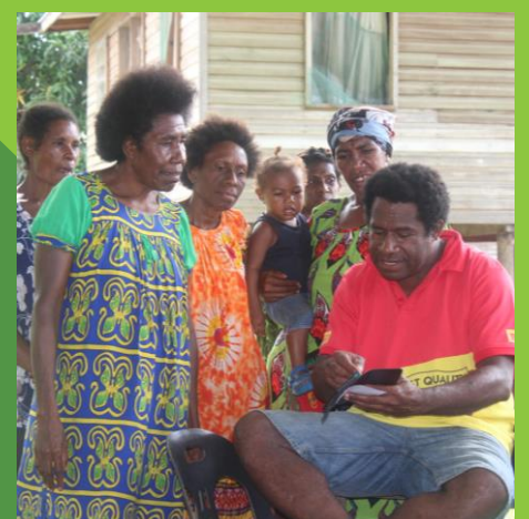
Women farmers were shown how to use Cell Moni Wallet on an android phone.