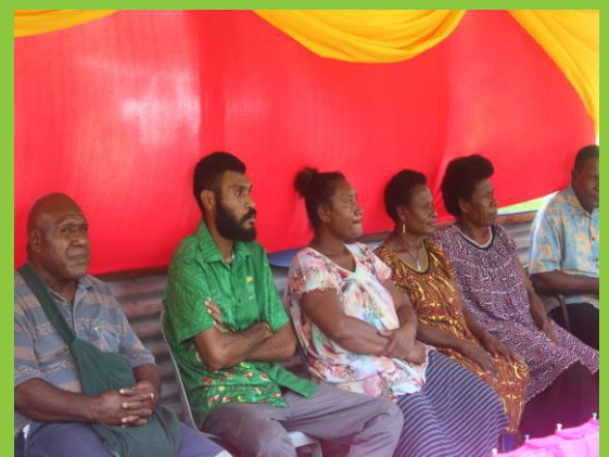
Grow PNG as guests with the women farmers' representatives.