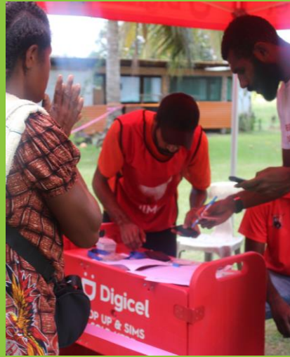
A woman farmer registering her Digicel Cell Moni Wallet.