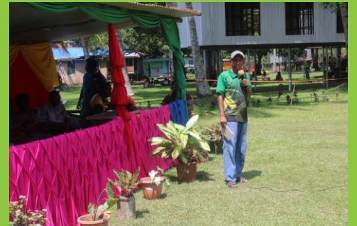
Agri Assurance team representative giving his remarks on Agri Insurance products.