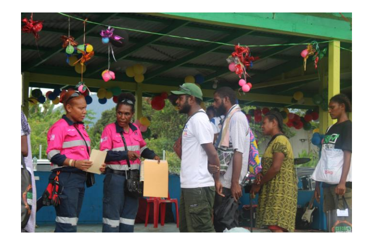
K92 Mine Ltd sponsored the prize for the Best Food Display, along with consolidated prizes for other farmer groups that participated in the competition.

A farmer association from Finschaffen District, Morobe Province, showcased their organic variety of rice at the World Food Day celebration in Mutzing Station, Markham