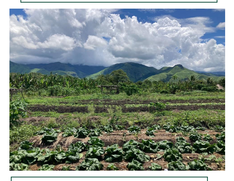
Fresh lettuce crop grown in Watarais, Markham Valley