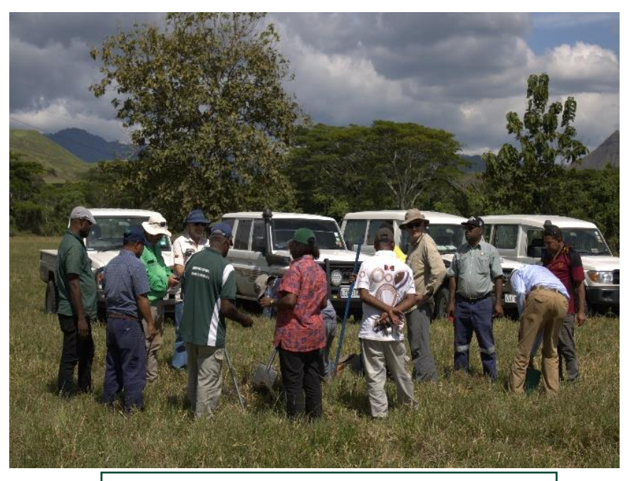
Landscape assessments and soil sampling at Ramu Beef, West Leron Plains.

Throughout the trip, the team received strong support from both commercial agribusinesses and local communities, highlighting the potential benefits of the PNGRIS project for smallholder farmers and agribusiness partners.