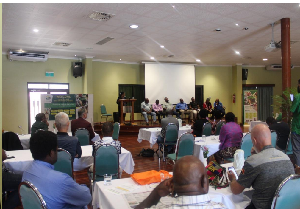
The panel consisted of representatives from the Government, Agribusiness, and key relevant stakeholders.

The Land Access ToT program will enable certified trainers to carry on the training to a wide reach. This is a way forward to encourage customary landowners to offer their land for agricultural development.