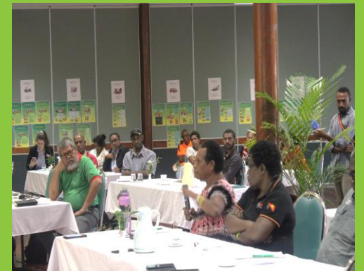
Question and answer session.