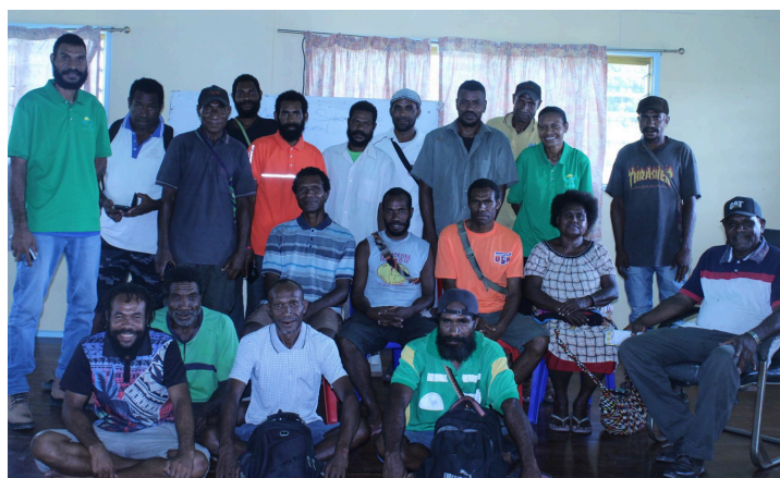
Grow PNG and the Markham Smart Farmers Association at Mutzing Station, Markham District, Morobe Province.

The meeting concluded with a commitment to addressing challenges and fostering partnerships for sustainable agricultural growth in the Markham District. Grow PNG will continue its work to collaborate with its partners in driving transformative change in the Markham and Ramu valleys.