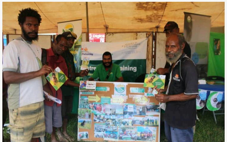
Farmers visited Grow PNG information booth during the NARI Innovations Show

He highlighted the need for private sector investment in agriculture in Papua New Guinea to support smallholder farmers and addressed challenges like land tenure, irrigation, and finance, emphasizing the urgency of finding solutions for agricultural development.