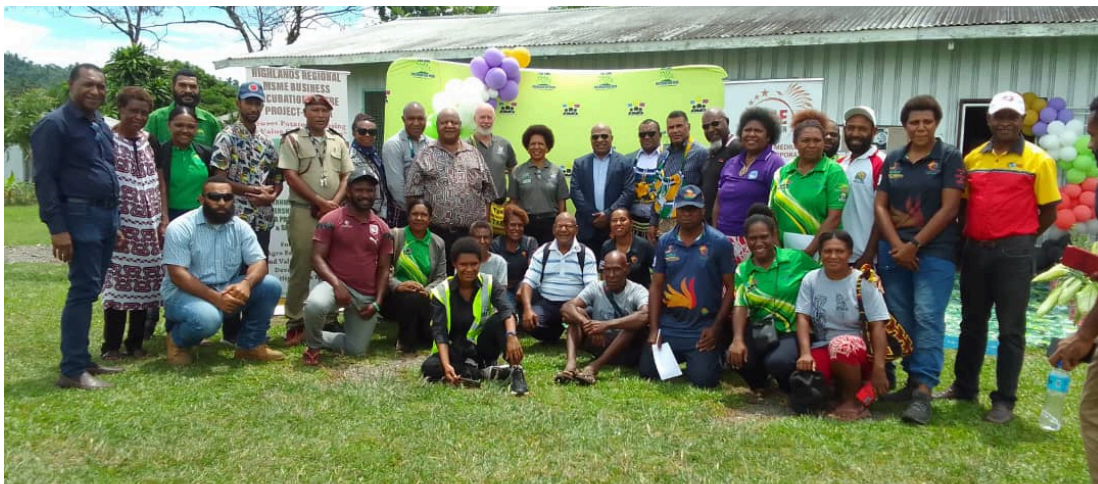
Grow PNG team with and other partners of Tok Stret Consultancy

Moreover, the partnership between TSCL and SMEC symbolizes a new era of joint ventures driving socio-economic development. By combining strengths, they aim to unlock opportunities and innovate together. SMEC looks forward to collaborating with Grow PNG to expand their impact and spearhead sustainable development projects for positive change.